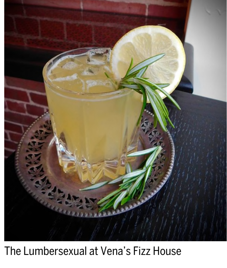
The Lumbersexual at Vena's Fizz House

"I think we might have passed it," says our Uber driver. "Or maybe it's not here anymore?" His confusion is not only forgivable, it was designed for. The dark, minimalist storefront of The Bearded Lady's Jewel Box is so deliberately speakeasy-incognito, most of its business comes through word of mouth.