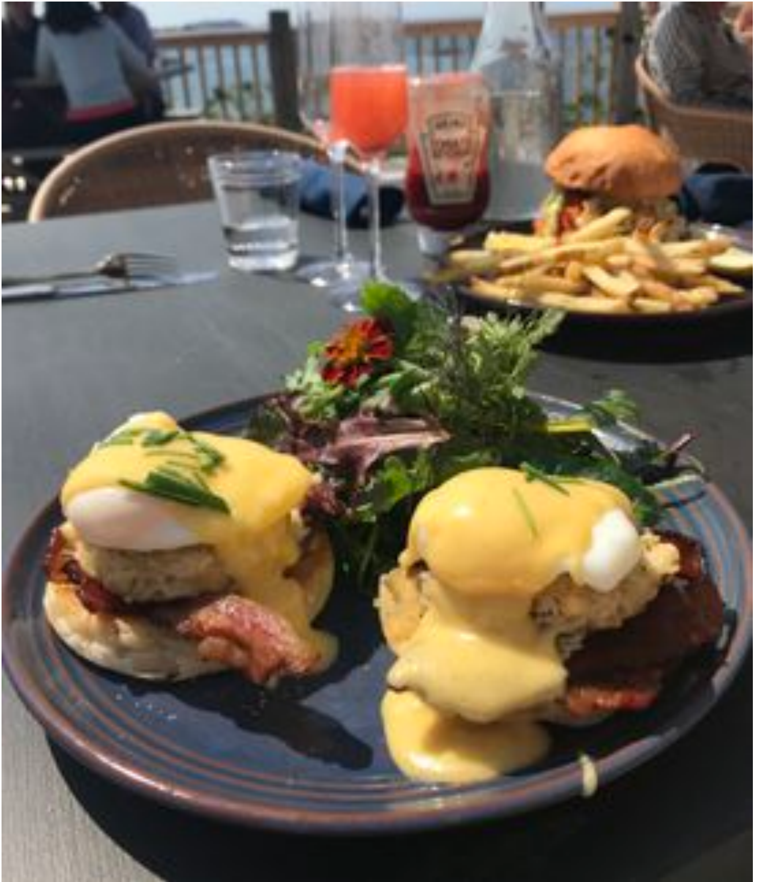
Crab benedict during brunch at Arogosta, in Deer Isle, Maine.