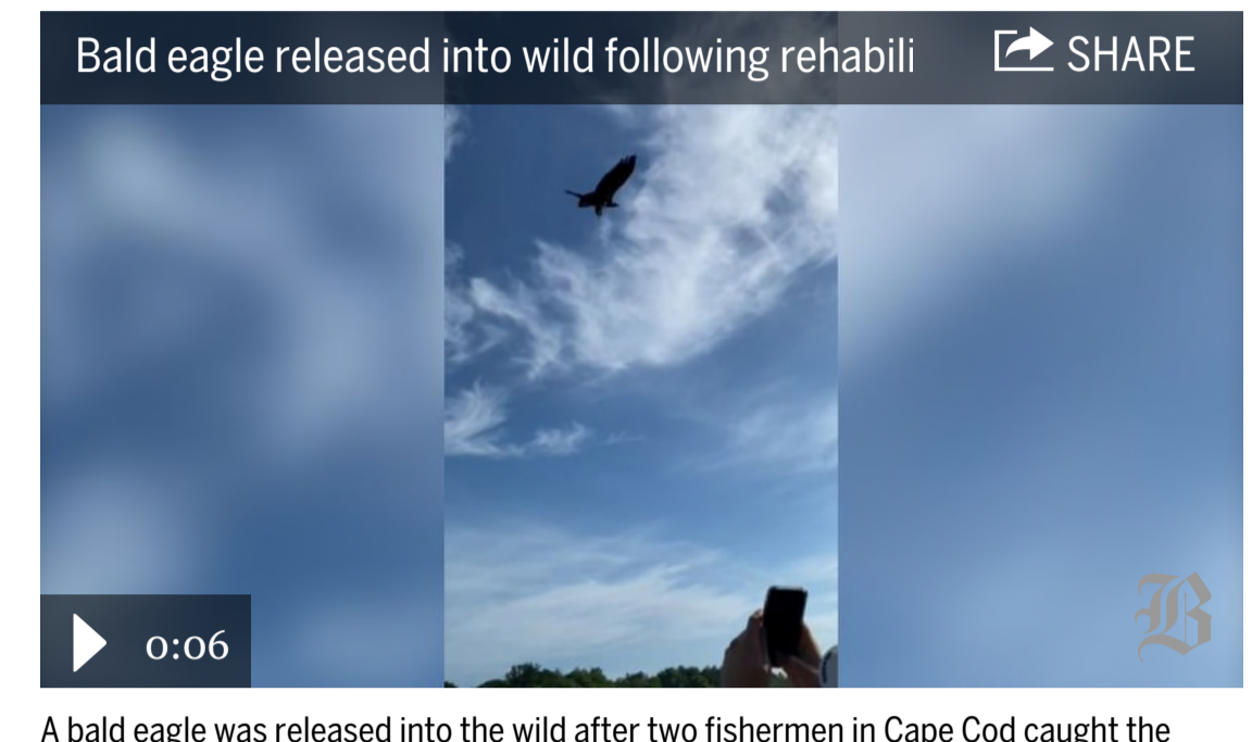
A bald eagle was released into the wild after two fishermen in Cape Cod caught the eagle.