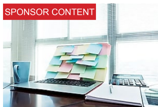
Manage your time visually with monday.com by Project-Management.com