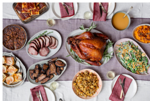
16 Not-So-Traditional Thanksgiving Takeout Packages in Boston