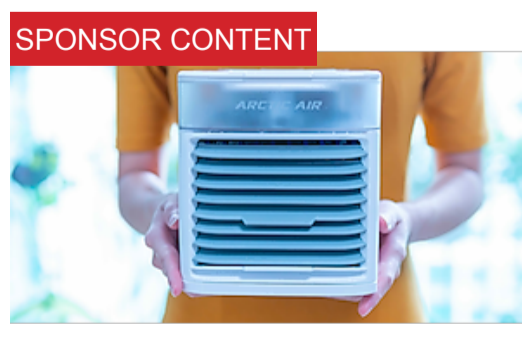
Refrigerate Any Room in 2 Minutes by ArticAir