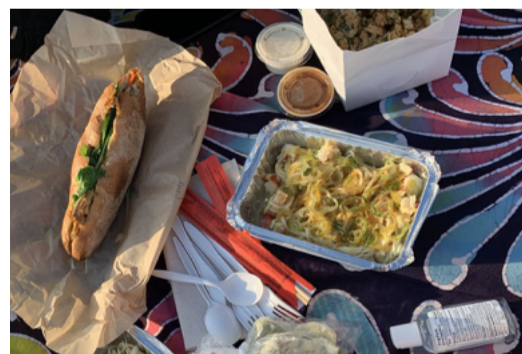
Eight Fun Takeout Ideas near Boston-Area Beaches